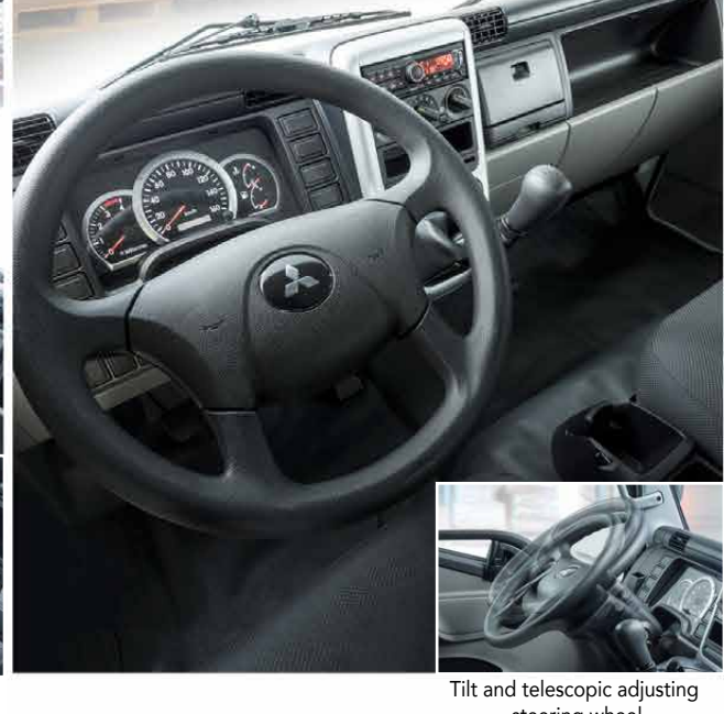
First in class dash-mounted gear shift lever