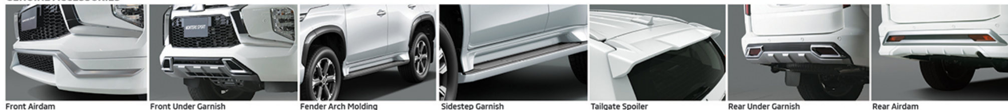
Front Airdam Front Under Garnish Fender Arch Molding Sidestep Garnish Tailgate Spoiler Rear Under Garnish Rear Airdam