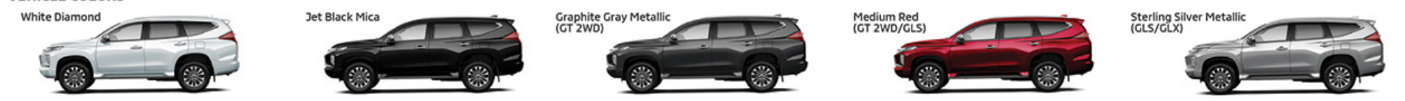
White Diamond Jet Black Mica Graphite Gray Metallic (GT 2WD) Medium Red (GT 2WD/GLS) Sterling Silver Metallic (GLS/GLX)