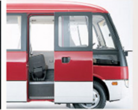
Automatic door provides convenient passenger access and easy driver monitoring