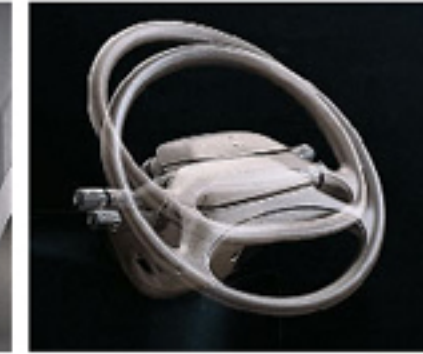
• Tilt Adjustable Steering