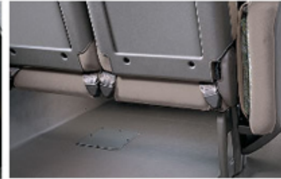
• More Leg Room