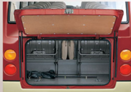
• Rear Cargo Space