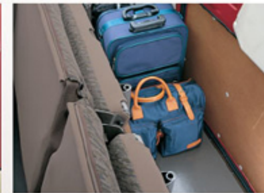
• Rearmost Folding Seat