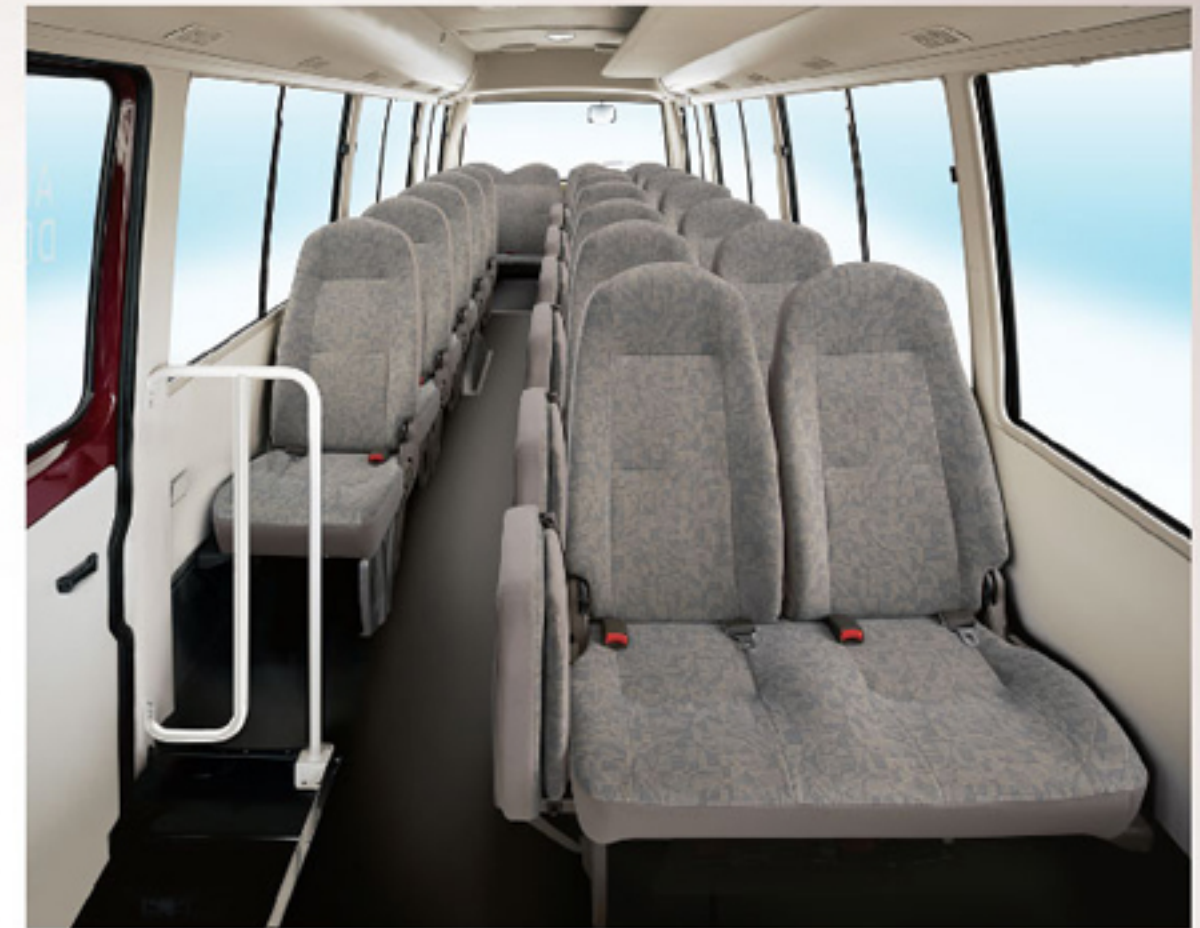
• Spacious and relaxing interior for all passengers • Reclining Passenger Seat