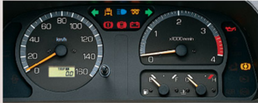
• High-Contrast Speedometer and Tachometer